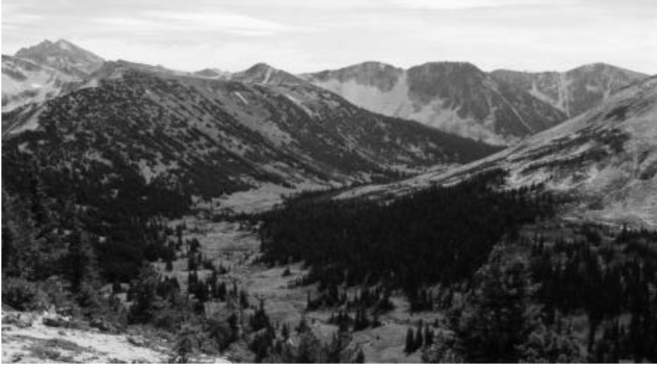
Fig. 5. Cattle Creek in Stein Park shows range of habitat types from riparian valley to mountaintop with treeline going up much higher on north side (left) than on the drier south side. Photo by Steve Ogle, August 1998.

Research on wildlife responses to climate change is beginning to emerge (Inouye et al. 2000). With climate change, upper limits of plant growth will increase, and food availability per unit area for alpine herbivores may increase. However, with the increasing altitude of treeline, another expected consequence of climate change, alpine habitats will become more fragmented with smaller and more isolated patches. Animals living in these patches will have smaller populations and be required to disperse longer distances to other alpine patches, or pay the consequences of not dispersing (Martin et al. 2000, Roland et al. 2000).