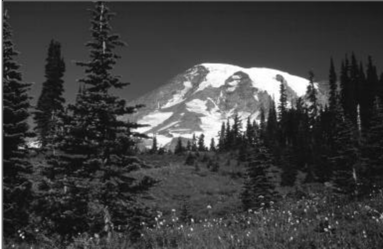
Fig. 1. Sub-alpine flowers in the foreground, open montane forest with hints of tree 'islands', and a spectacular view of snow-capped Mt Rainier in the background. Slide by Steve Ogle (#17), mid to late August 1999.

climates are characterized by high winds, low temperatures, low effective moisture and short growing seasons (Braun 1980, Billings 1989). Alpine zones increase in elevation from north to south and from coastal areas to interior. Northward across the mid-latitudes of North America, treeline decreases about 152 m (500 ft) in elevation per 160 km (100 mi, Daubenmire 1954). In the Cascades, treeline increases in elevation from about 2000 m (6560 ft) on the west side to 2500 m (8200 ft) on the eastern continental side (Arno 1984). In this chapter, the alpine zone includes two habitat types, alpine treeless and partially vegetated areas at the top, and the sub-alpine, which is the zone between closed upper montane forest and the upper limits of small trees in open parklands.