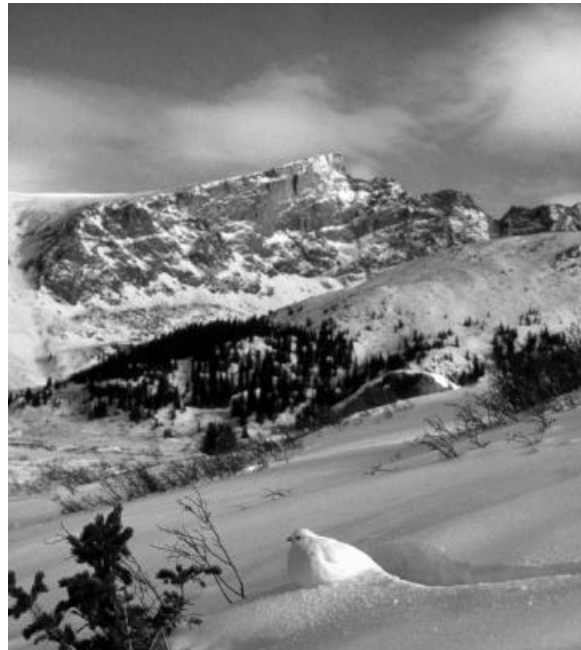
Fig. 2. White-tailed ptarmigan in winter plumage and in winter habitat at Guanella Pass, Colorado with Mount Evans (breeding habitat) in the background. Photo by K. Martin, January 1998.

With such limited vertical structure in the alpine, passerines need to choose nest sites that are protected