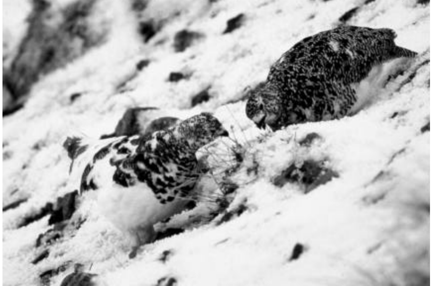
Fig. 3. Male (l) and female (r) white-tailed ptarmigan in cryptic spring breeding plumage feeding on alpine territory, Loveland Pass, Colorado.

as much as possible from predators and extremes of wind, precipitation, or temperature. Rosy finches and mountain bluebirds ( Sialia currucoides ) nest in inaccessible cliffs or rock crevices, while pipits and horned larks nest on open grassy tundra slopes that are potentially more exposed to predators and climatic extremes. Johnson (1965) reported 81% of 139 rosy finch nests were in cliff crevices, and suggested that rodents might limit rosy finch nesting to cliffs. Nest sites in cliff crevices and under rocks are colder thermal environments than open cup nest sites in the alpine and arctic tundra (Lyon and Montgomerie 1987, Wiebe and Martin 1997). Water pipits ( Anthus spinoletta ) in Austria spent three to